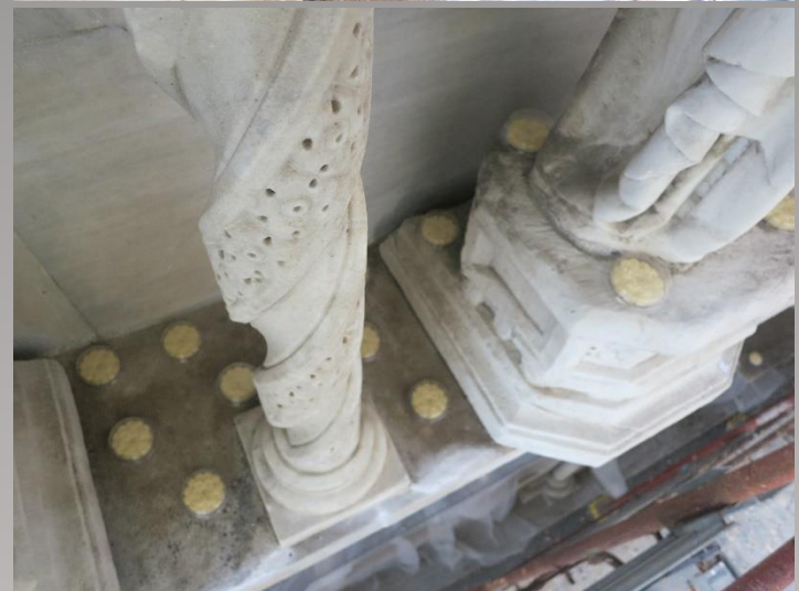
In December 2014, eight nests were observed behind the bases of the 13 statues at the second floor of the south elevation. The bases of the statues were treated with 小島 Bird Free as shown above.